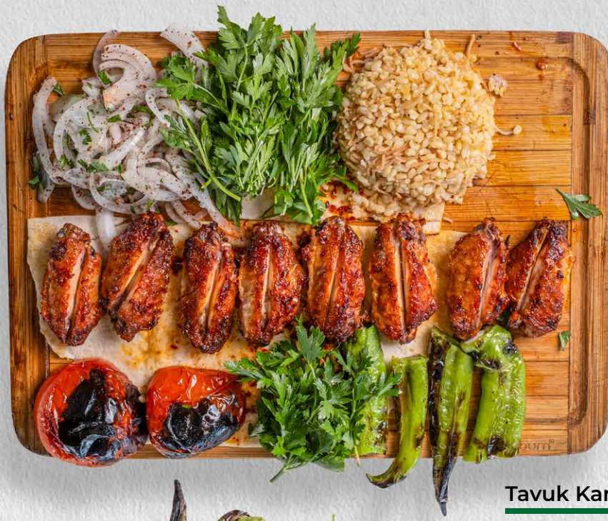
Tavuk Kanat / Chicken Shish