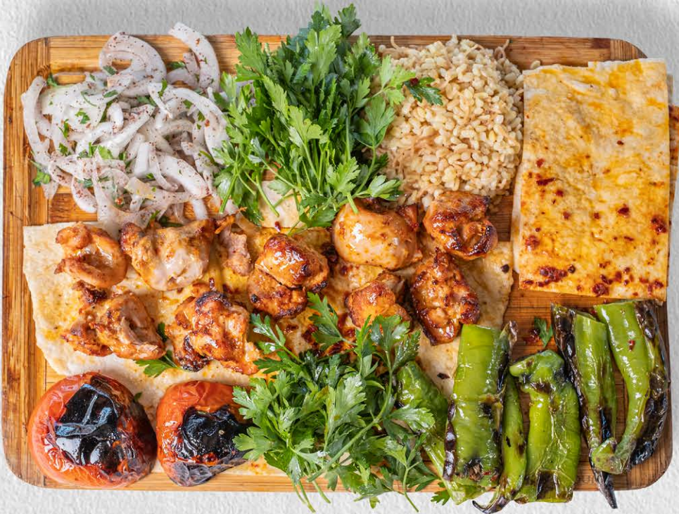
Tavuk Şiş / Chicken Shish