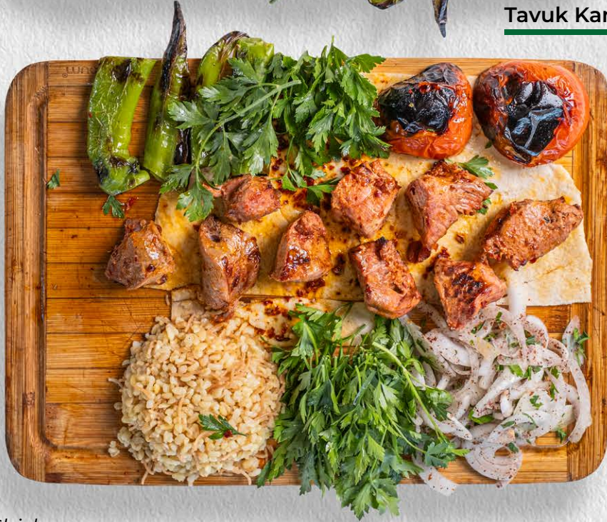
Dana Şiş / Lamb Shish