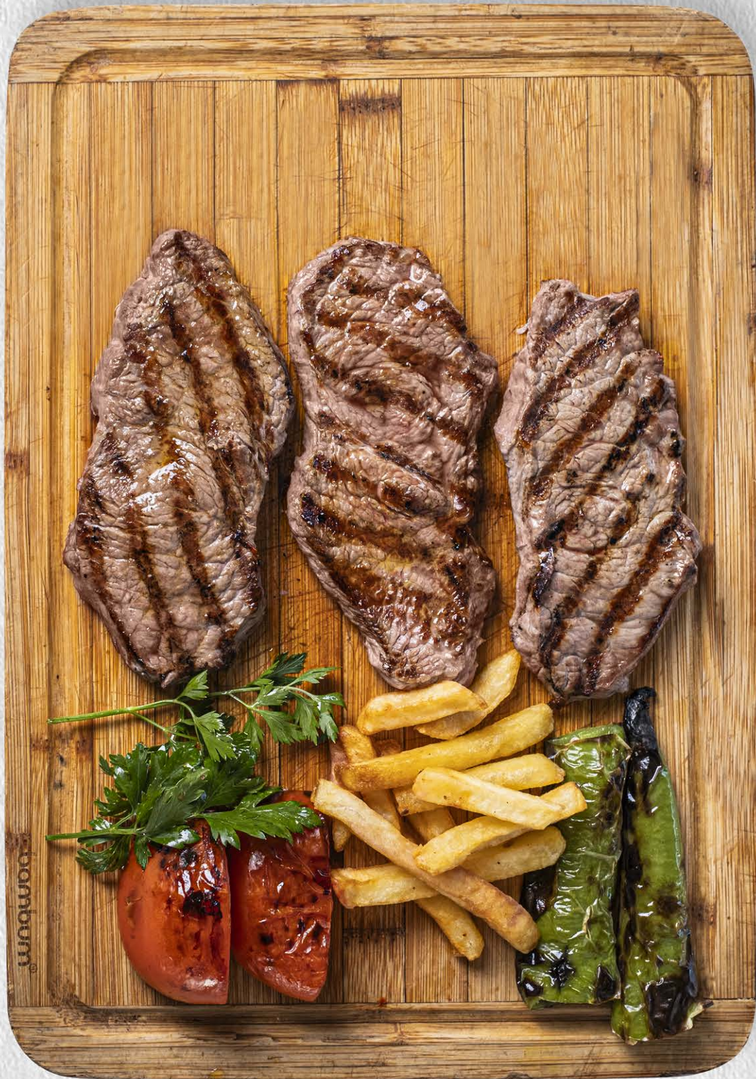
Dana Antrikot / Veal Entrecôte