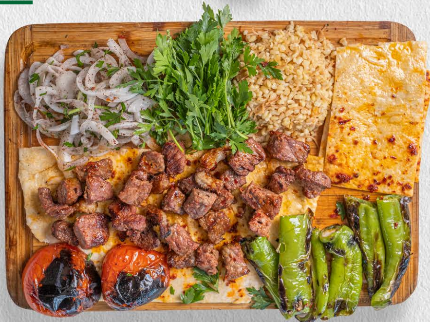
Çöp Şiş / Lamb Lath-Grilled Small Pieces of Lamb Meat on Wooden Skewers